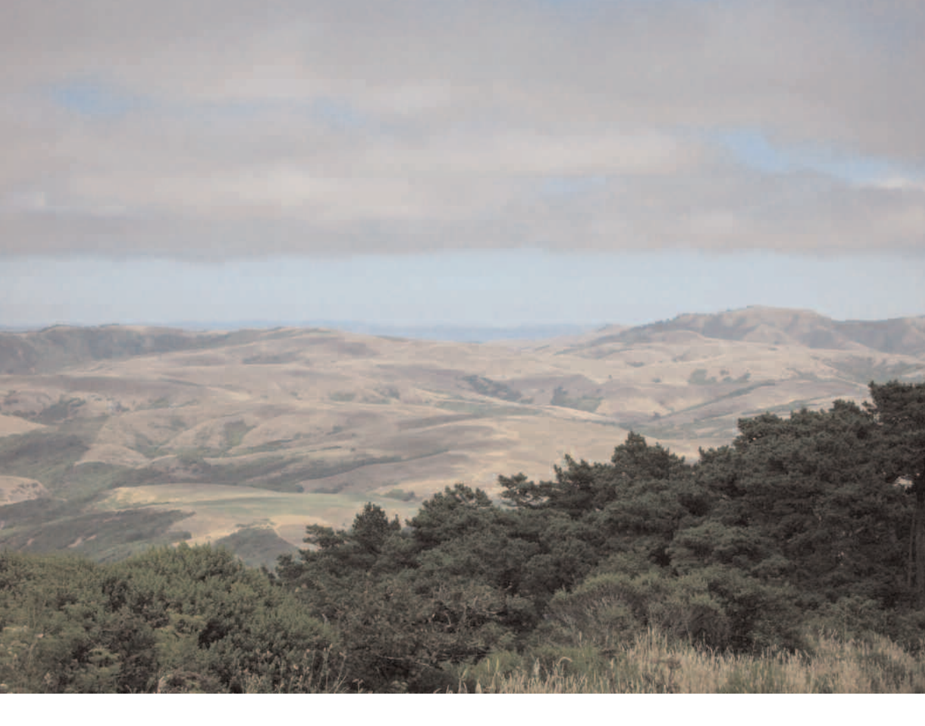
Point Reyes National Seashore.