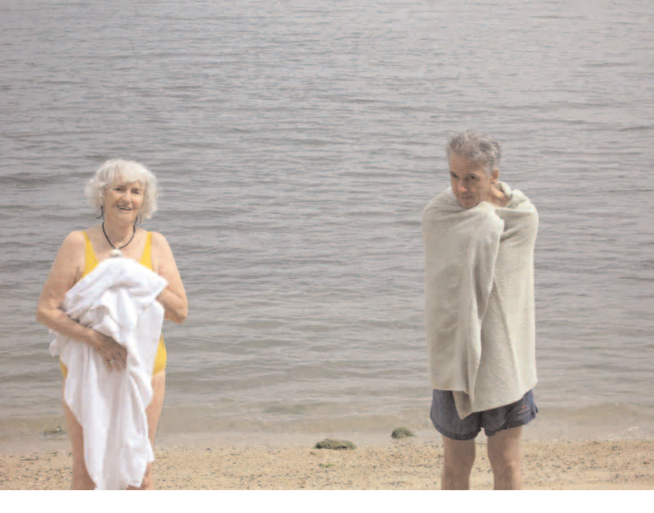
Following the picnic was a swim.