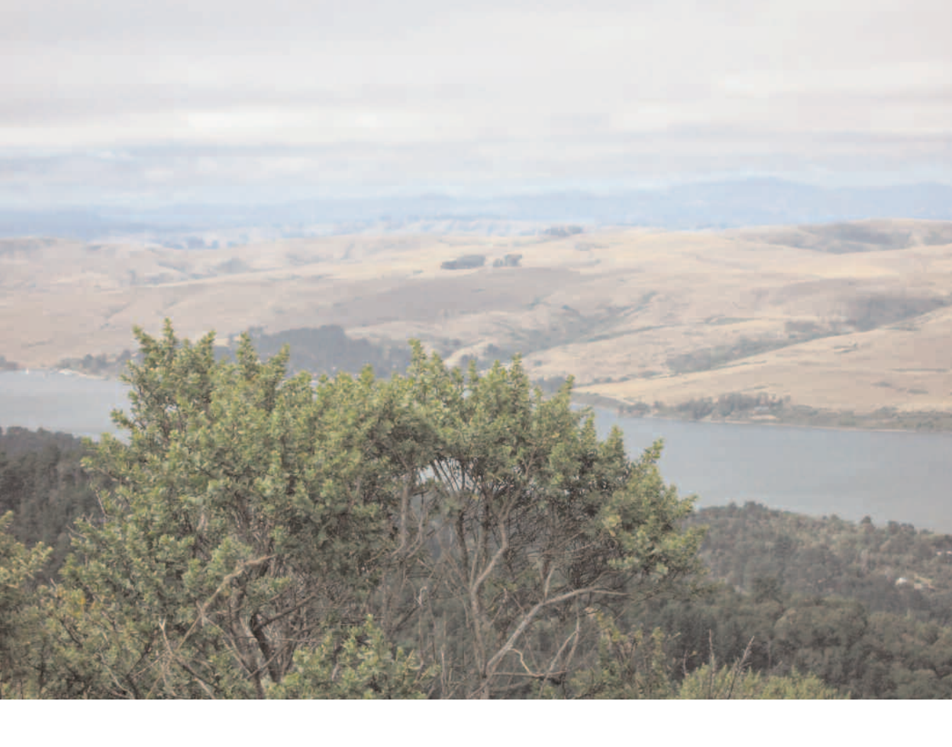
Tomales Bay, from Inverness Ridge, Point Reyes National Seashore.